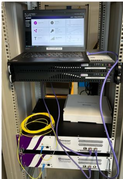
KEEQuant System for CV QKD demonstration across the KIT Quantum Link