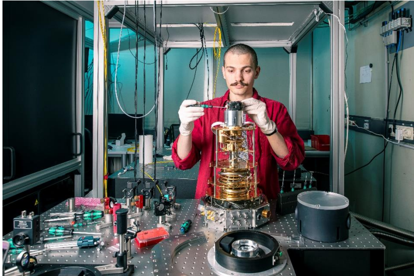
Optical Millikelvin Cryostat with integrated tunable microcavity platform for efficient spin-photon interfaces and quantum repeater nodes